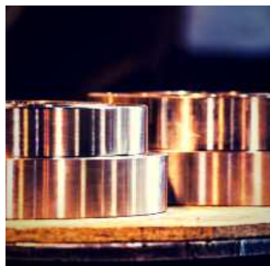
PLATE AND PLATE PRODUCTS